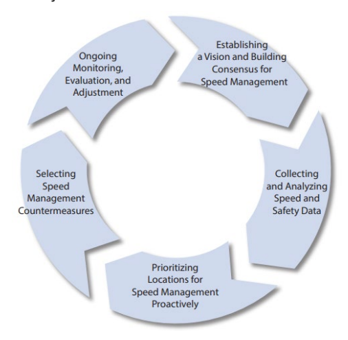
The Safe System Approach for Speed Management Framework.

speed management, collecting, and analyzing speed and safety data, prioritizing locations for speed management proactively, selecting speed management countermeasures, and conducting ongoing monitoring, evaluation, and adjustment.