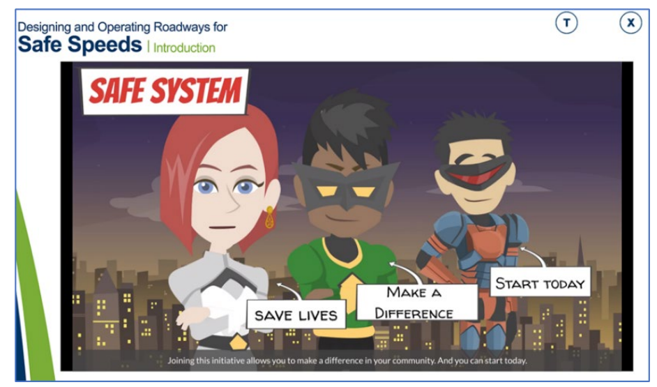
A screen capture from the self-paced Designing and Operating Roadways for Safe Speeds course.

The correlation between speed and injury crashes has been well documented throughout the scientific literature on traffic safety, and achieving lower speeds has been