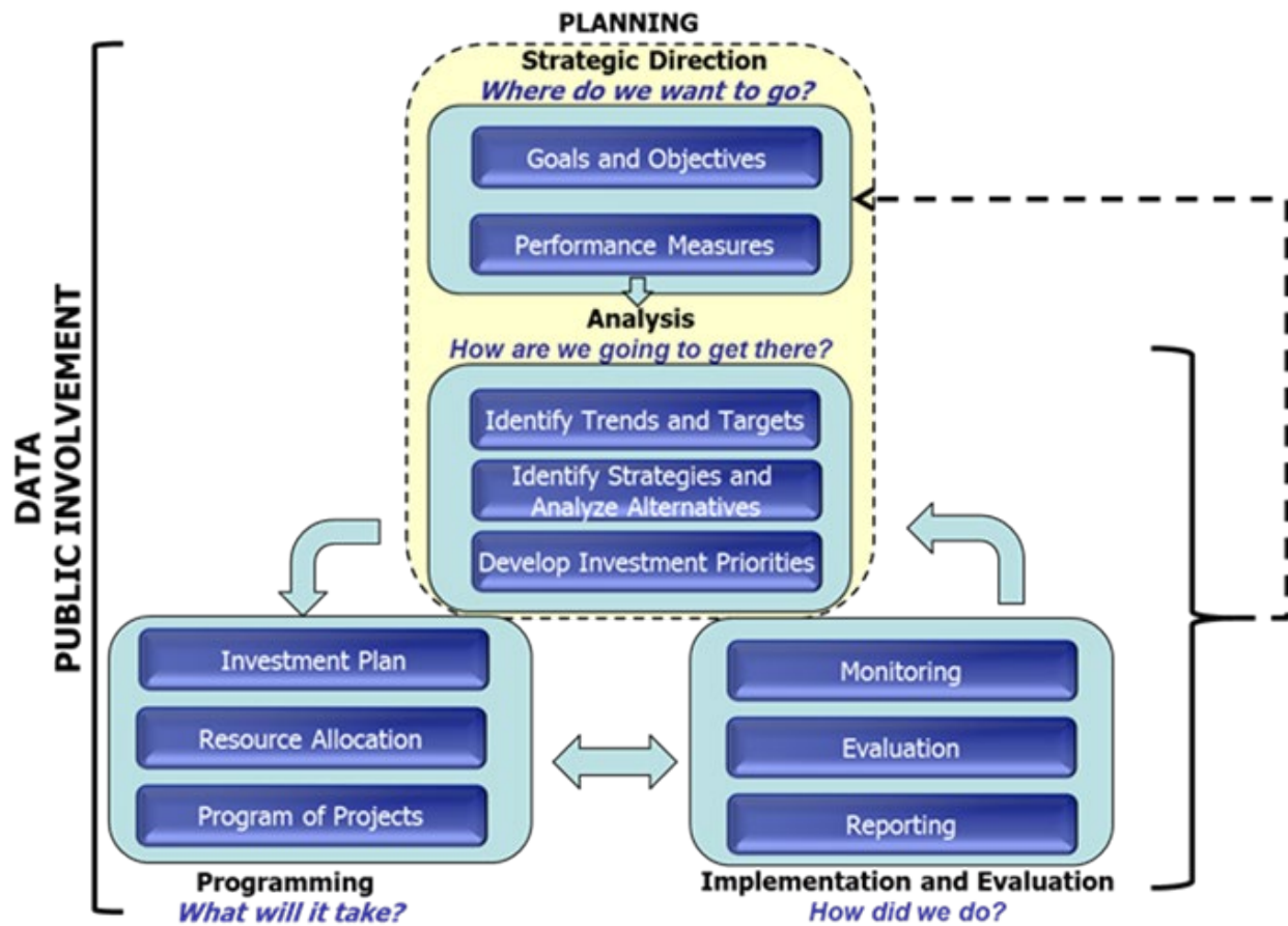
Figure 1: PBPP Framework

One benefit of PBPP is that it allows transportation agencies to communicate their goals and evaluate decisions based on data with other agencies, stakeholders, and the public. FHWA’s Performance Based Planning and Programming Guidebook provides the following lessons for effective implementation of PBPP related to data sharing and collaboration: 14