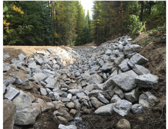
Above: FSR 4200-400 MP 0.2