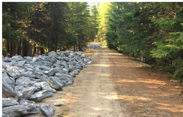
Above: FSR 4200-400 MP 0.2

Riprap staged for the upcoming riprap ditch work.