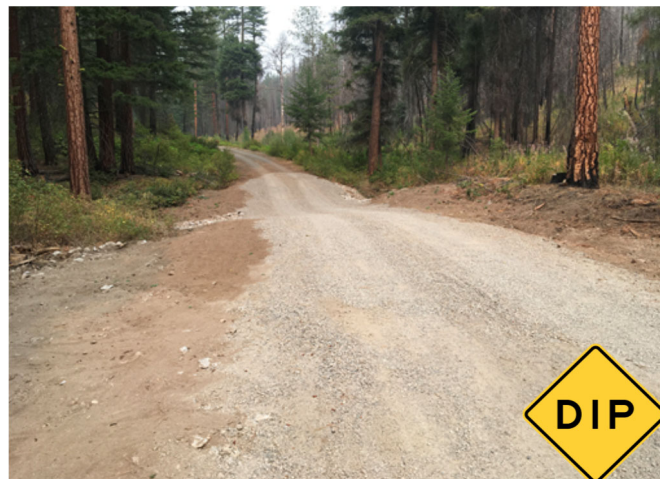
Above: Roadway Dip at FSR 4415-040 MP 0.4,

No risk of a plugged pipe culvert this winter.