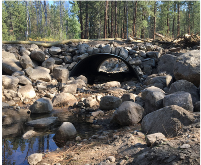
Above: 144-inch pipe culvert at FSR 5008-100 MP 0.75

Work at FSR 4200/FSR 4200-400 MP 0.2 is currently planned to start at the end of September once work at both of the FSR 4010-050 sites are completed.