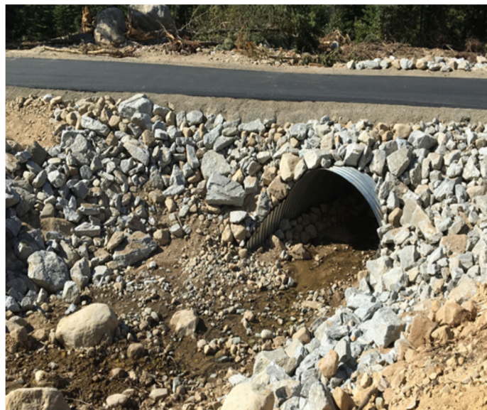
Above: 144-inch pipe culvert at FSR 5140 MP 10.2