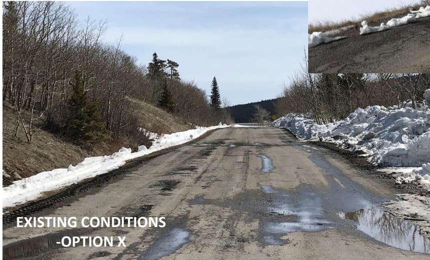
EXISTING CONDITIONS -OPTION X