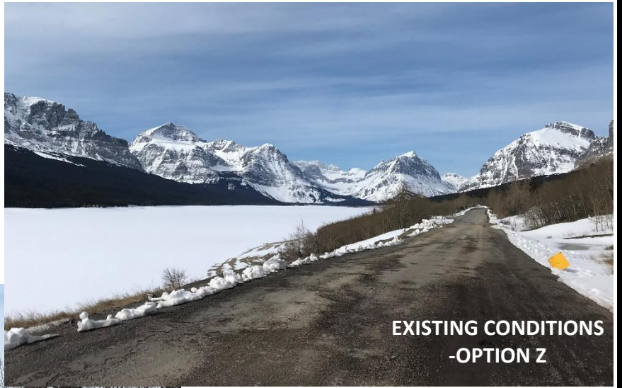
EXISTING CONDITIONS -OPTION Z