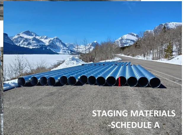
STAGING MATERIALS -SCHEDULE A