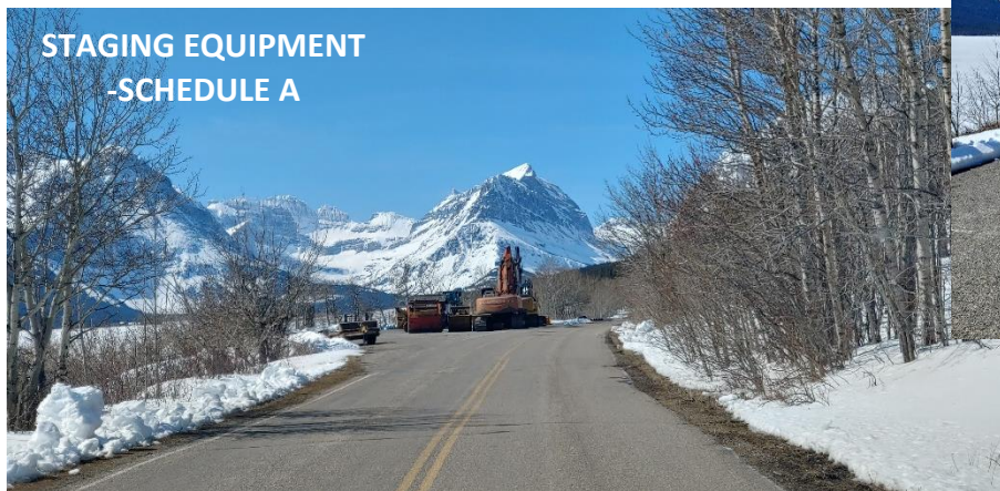
STAGING EQUIPMENT -SCHEDULE A