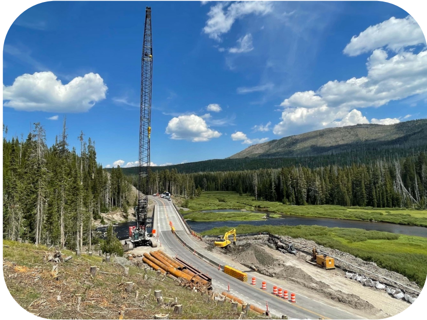
View of the project looking North. (Notice jersey barrier)