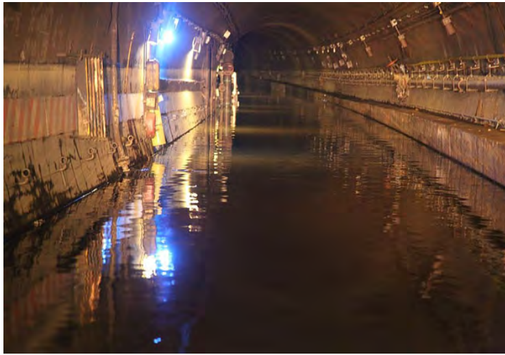
Hurricane Sandy flooding, New York, NY - 2013