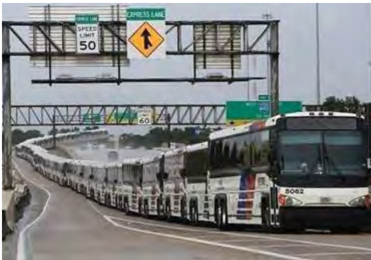
Hurricane Harvey preparations, Houston, TX- 2017