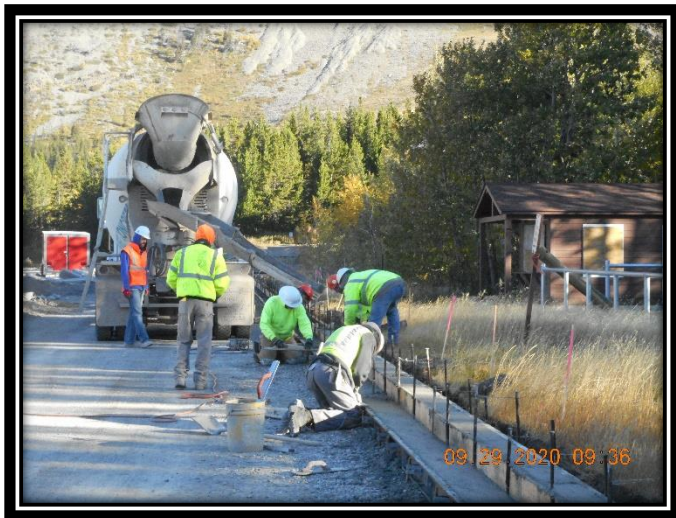
MGH Parking Lot Curb and Gutter Concrete Pour