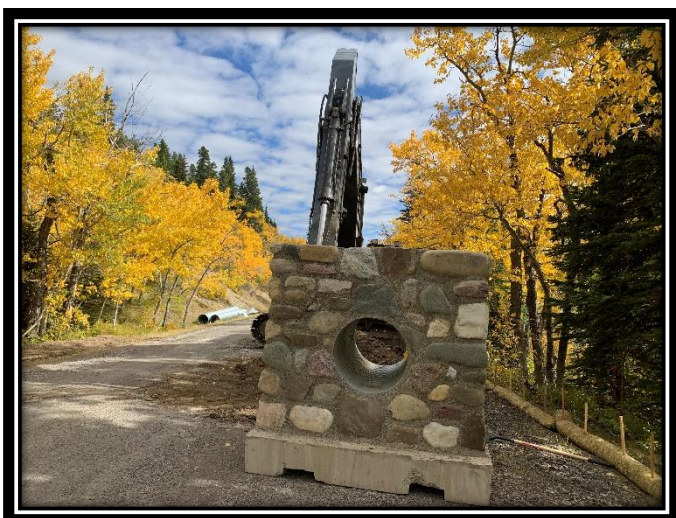
Installation of Precast Headwall at Option X