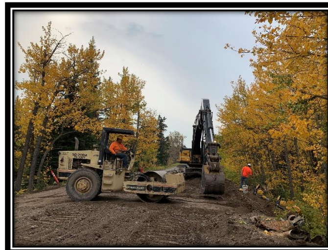
Installation of Culvert at Option X