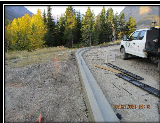
MGH Parking Lot Curb and Gutter Forms Removed