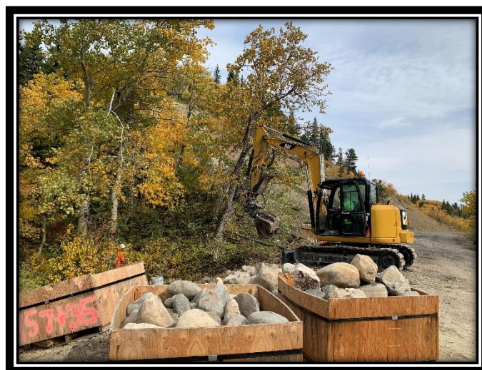
In-Place Headwall at Option X