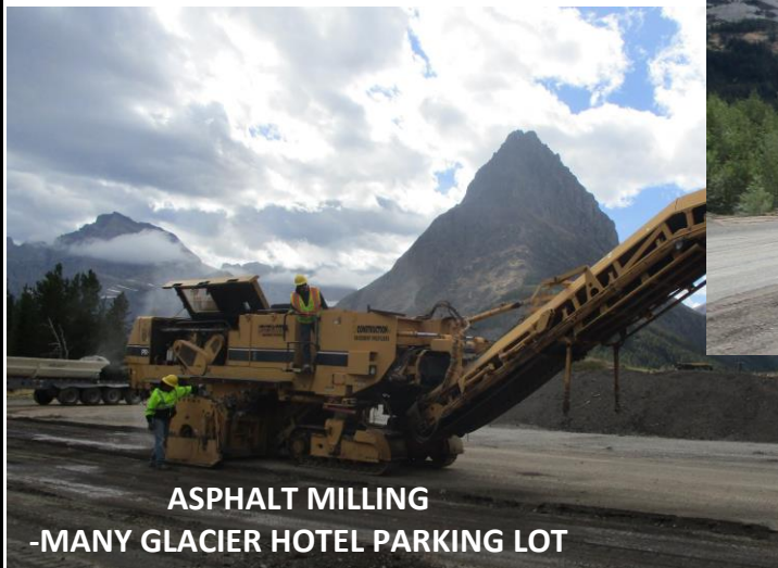
ASPHALT MILLING -MANY GLACIER HOTEL PARKING LOT