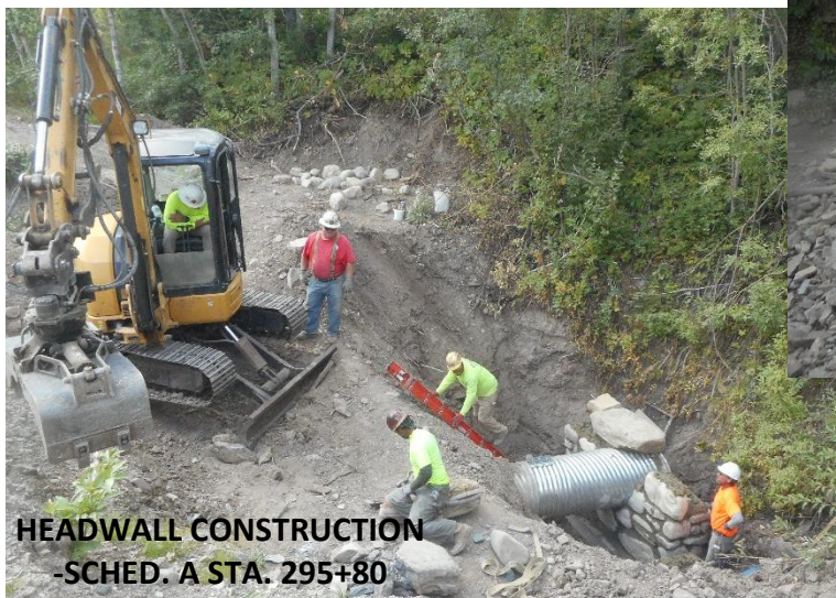
HEADWALL CONSTRUCTION -SCHED. A STA. 295+80