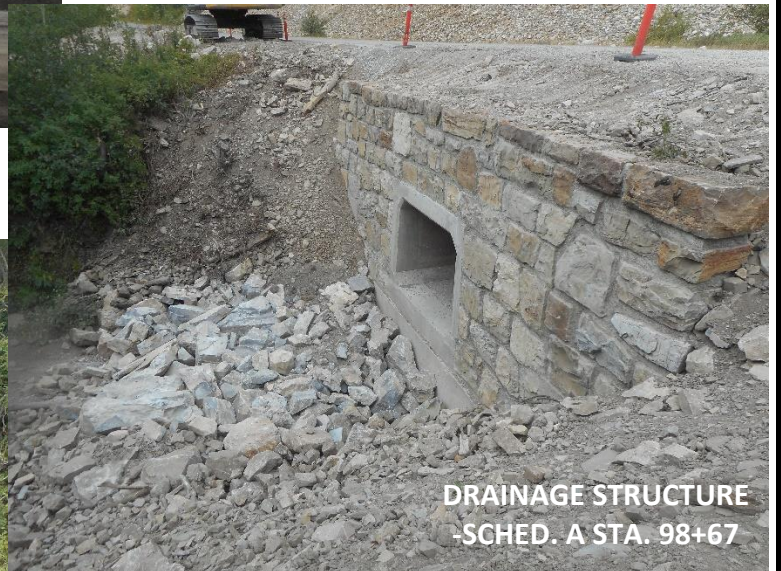
DRAINAGE STRUCTURE -SCHED. A STA. 98+67