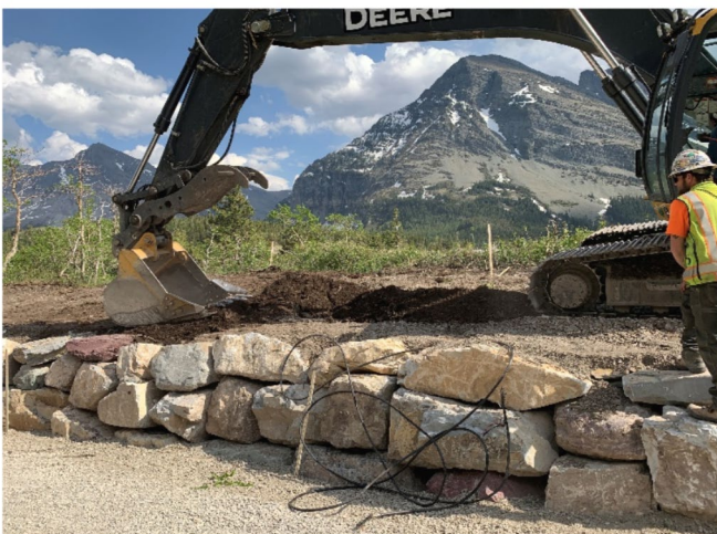
Finishing Touches are put on the Rock Wall Near the Hotel