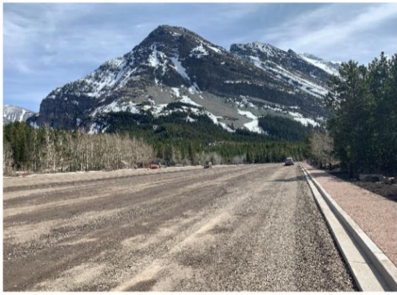
The Many Glacier Hotel Parking Lot is Prepared for Pavement