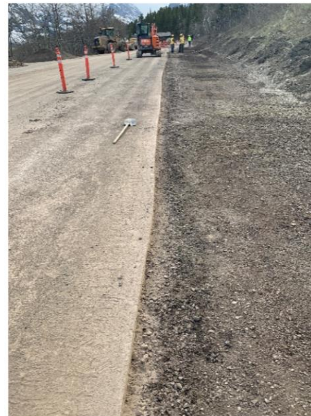
Preparing to Widen the Road at the Entrance Station