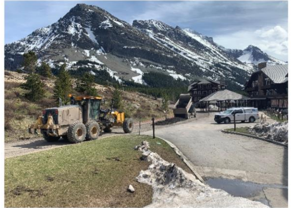
The Loop Road at Many Glacier Hotel is Prepared for Pavement