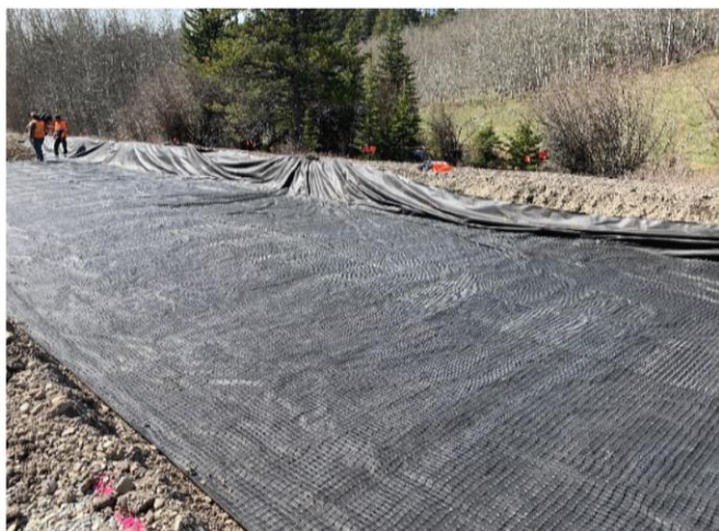
Geotextile and Reinforcing Geogrid are placed in Subexcavations to Strengthen the Road Foundation