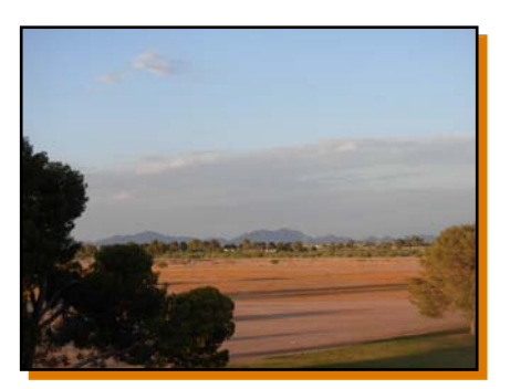
The Summit location: Casa Grande, Arizona.