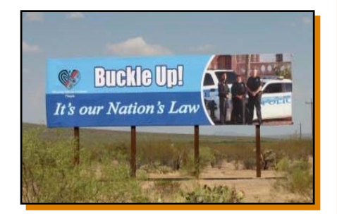
The Tohono O'odham Nation used this billboard to communicate its safety message.