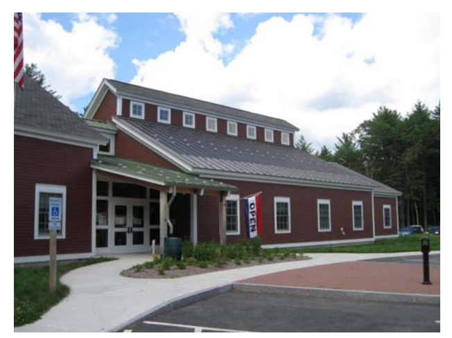
Visitor Center at the Assabet River National Wildlife Refuge

A more detailed evaluation of candidate projects, and the prioritization of recommended projects, was conducted during the summer and fall of 2012. The results are included in the Assabet River National Wildlife Refuge Transportation Study Report , finalized in January 2013.