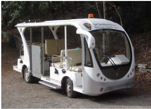
Example of electric shuttle vehicle

Procure electric shuttle vehicle: The shuttle would be used to expand access to sites in the refuge for visitors who have mobility impairments, transport school groups to learning sites within the refuge, and provide tours for other groups. It could also be used as a parking shuttle during larger events. The preferred vehicle would not require special charging infrastructure and would have fewer than 16 seats so as to not require special driver licensing.