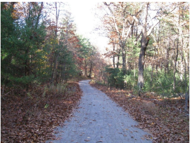
The recent project to construct a new parking lot at the North Entrance did not include repair of this 1,000-foot long roadway leading to the parking lot.

Reconstruct the North Entrance access road (White Pond Road): The roadway is in extremely poor condition and the project would widen the road from 14 to 18 feet to better accommodate the mix of walkers, bicyclists, and drivers who use it.