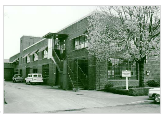
The southwest corner of Building C, 1965.

"Please do not use new stairway until temporary covering has been applied. Carpeting is on order which will be applied with adhesive. If stairs get dirty, adhesive will not stick."