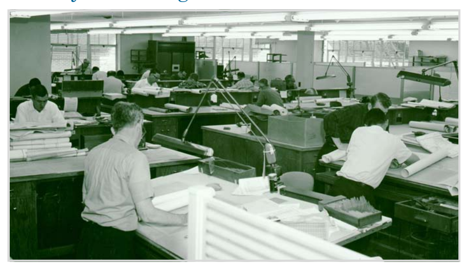
Before the 1971 remodel, the second floor design section would have looked much the same as in this 1965 photo.

Moves to accommodate the new staff and new arrangements were outlined week by week in the Vancouver Newsletter, and February 5, 1970, was moving day for the Survey and Design Branch: