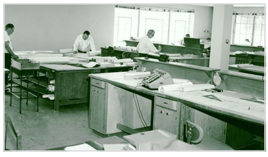
Another 1965 view of second floor office space, looking toward the northeast corner.

An automotive paint shop once occupied the SW corner of the first floor