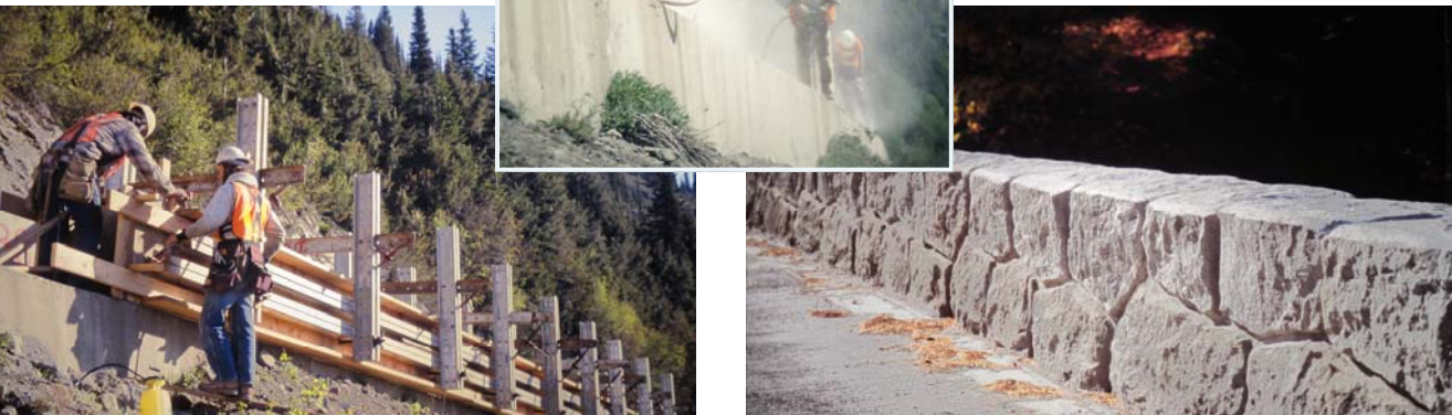
Center: Laborers drill holes in the top of existing retaining walls where vertical rebar will be epoxied into the holes. Left: Forms for the guard-wall are installed on top of the retaining wall. Right: The guardwall after the forms have been removed. After final curing, the concrete will be stained to emulate the colors of stone.

This concrete work posed some problems for the contractor. "Constructing these concrete guard walls required a substantial amount of concrete," Gary said. "We were bringing in10-12 trucks every day. The supplier was based in Yakima, 90 miles away. His plan had been to batch the mud in Yakima, mix it on the road to the project, and then pour it right away.