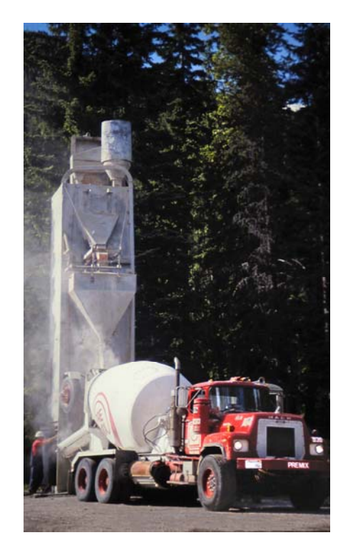
A portable batch plan erected on the project adds cement to a truck. Trucks left the supplier in Yakima loaded with sand, water, and gravel.

"Concrete that is mixed on the road this way must be used within the first 60 to 90 minutes, so getting a batch from Yakima over 90 miles of road to the project was a real problem."