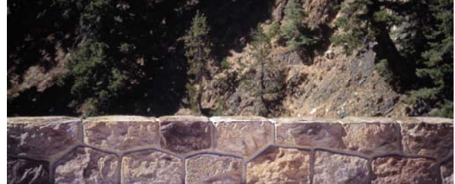
The final guardwall, after staining.