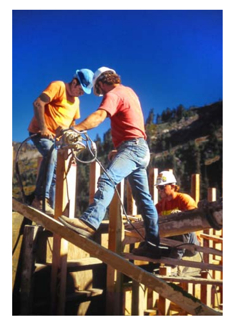
Laborers use a vibrator to consolidate the fluid concrete. This eliminates air bubbles and ensures sand and gravel are distributed evenly.

winter. "I was living in a fifth wheel trailer down in the trailer park, down by Natches," and some of the contractor's crew were also living there, he said. "It was pretty miserable there in the RV Park when it was so cold and snowing and freezing."