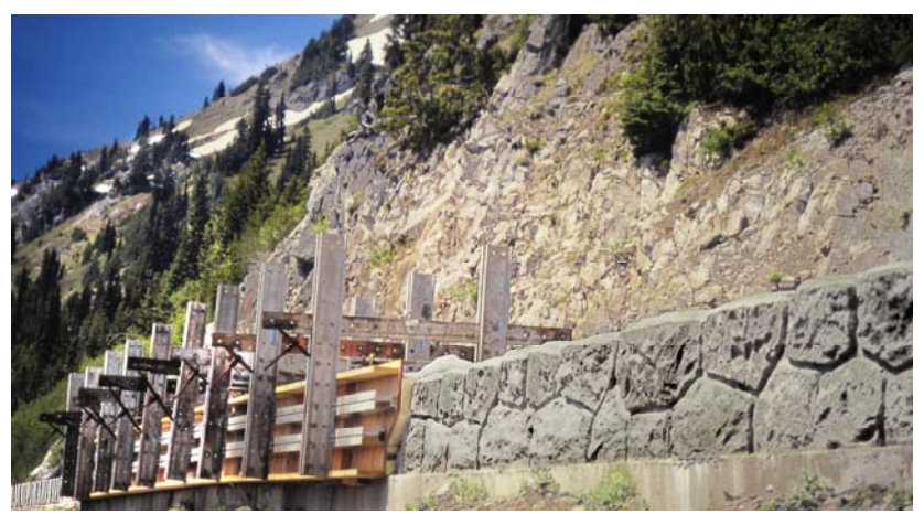
Forms remain in place at the left until the concrete achieves its initial set. At right, forms have been removed from an earlier pour. The insides of the forms are textured to give the concrete guardwall an appearance of stonework.

$750,000 worth – that "the Vancouver office realized the mistake.