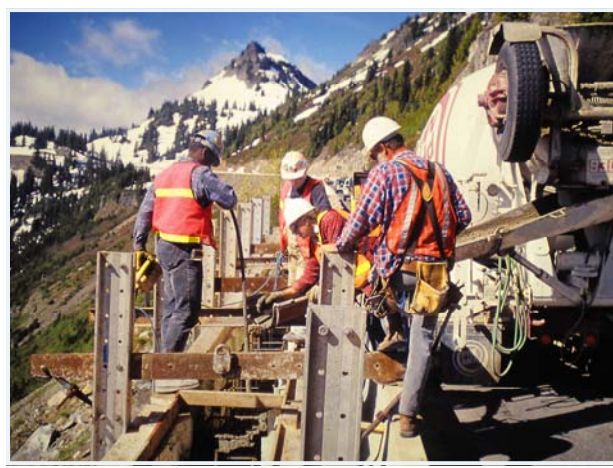
A truck delivers concrete to the guardwall forms. Sixty linear feet of forms are filled at a time.

"In the end, they put a cement silo on the project. That way they could put the sand and aggregate and water into the trucks in Yakima, send them up to the project, and add the cement at the project. By doing this, it sat in the mixer for only 15-20 minutes."