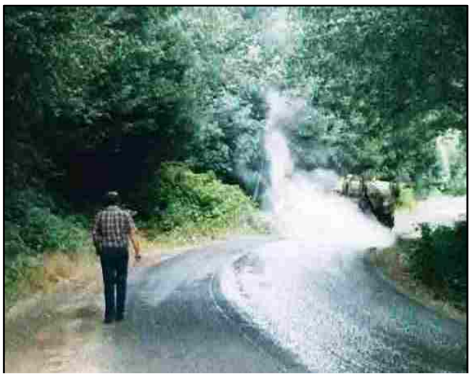
Above and top: Wells Creek-Vincent Road, early 1970's.

could move it on a temporary basis. If you wanted to move it from Eugene to Coos Bay" he went on, "you didn't have to go to the BLM district manager."