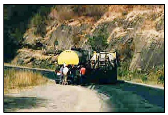
Above and below left: Wells Creek-Vincent Road, early 1970's.

"We didn't say to the individual, 'you have to be there 24 hours.'....If a weekend came around, and the guy wanted to go for a trip or