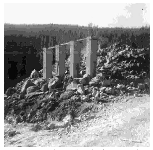
Construction begins for a bridge across the St. Vrain River in Peaceful Valley, Colorado.

While the crew was living there, Peaceful Valley Resort was not always peaceful. "It was a pretty wild bunch," he said. "We all lived in one cabin with about