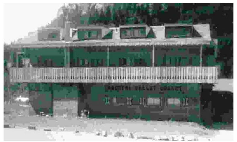
The main lodge at Peaceful Valley Resort, 1959.

"So one day we were out eating lunch on the job in the forest and we stole the boss's lunch, took his sandwiches, and put one of our eggshell sandwiches in it. He bit into it and yelled, 'that dang woman!" The guys admitted to the swap: "Oop! That's one of ours; that's what we've been talking about." The lunches soon improved.