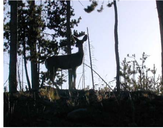
A deer caught by a WFLHD Construction Branch employee at Yellowstone Park.

"They sent me over there to work on the roads in Glacier National Park....We put in the final survey...on what they call the L line alignment for Hwy 2 on the southern edge of the park." When he went back the following year, "we had crews on Highway 2 (and also on) Two Medicine