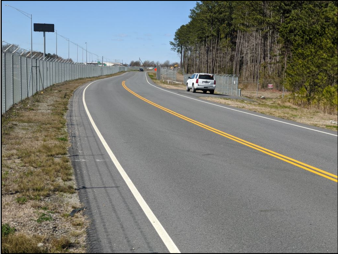
FIGURE 5: East Patrol Road (Looking Northeast)