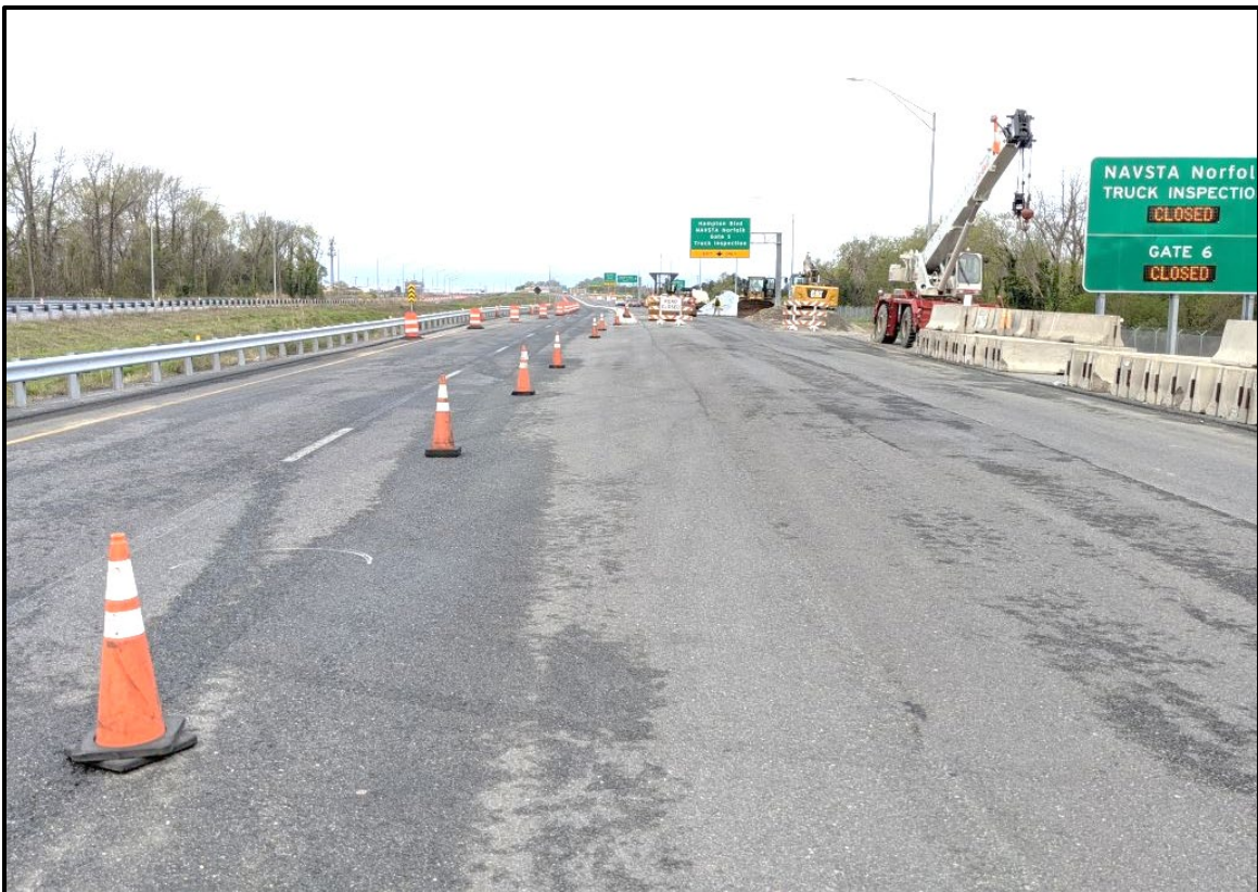
FIGURE 2: Ramp A (Looking West)