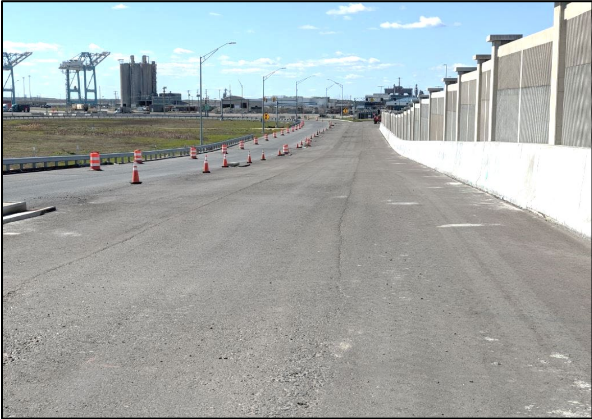
FIGURE 1: Ramp A/Gate 6 from B601 (Looking West)