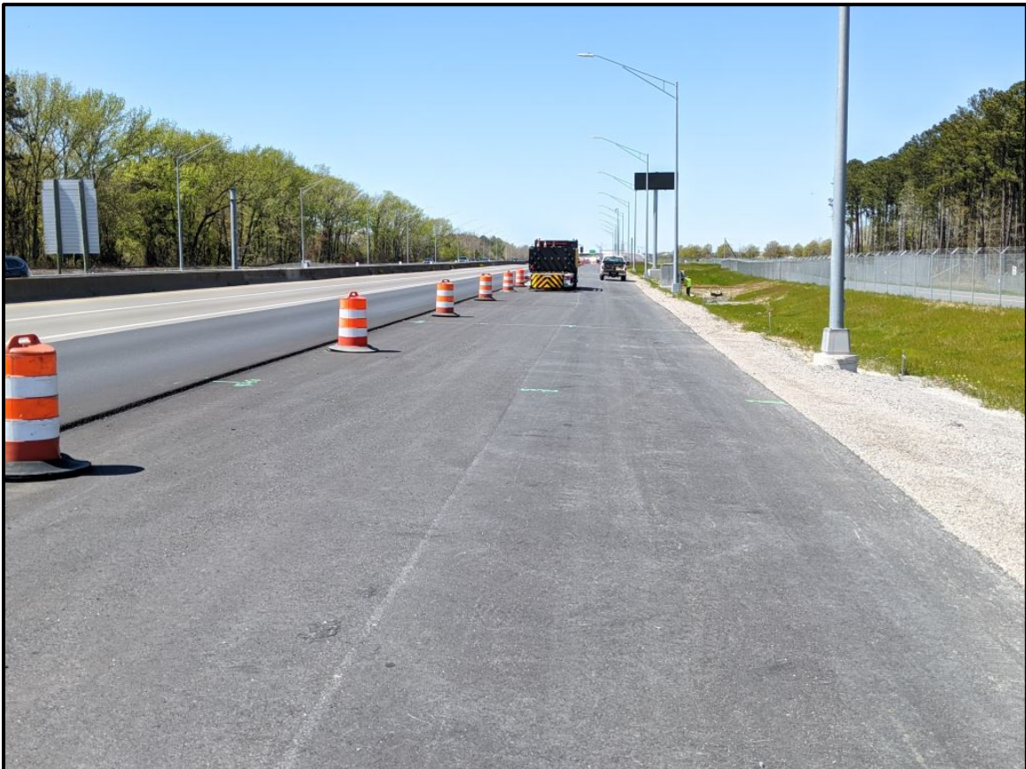
FIGURE 6: I-564 Westbound (Looking West Toward Ramp C)