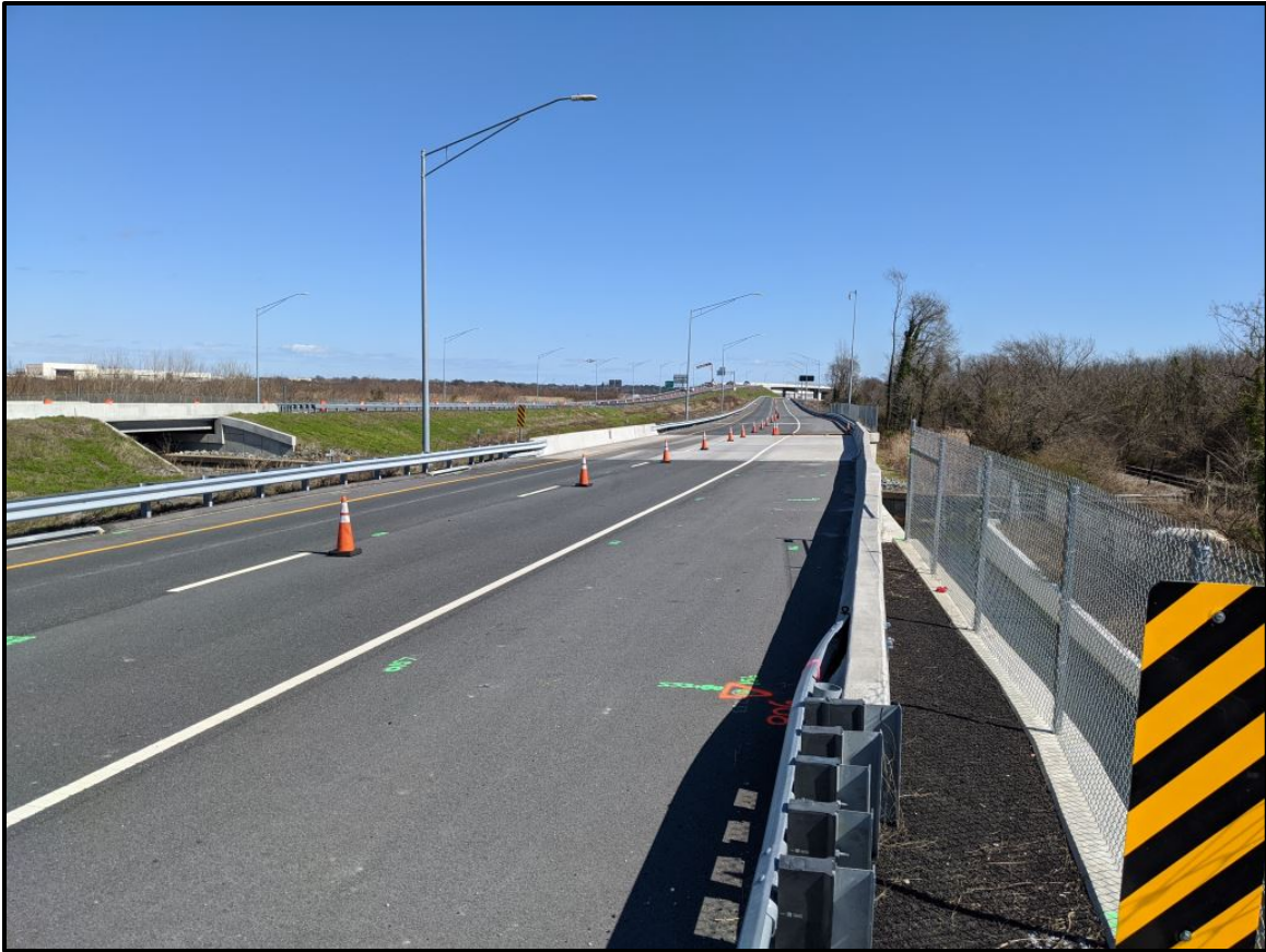
FIGURE 3: Ramp D (Looking East near B606)