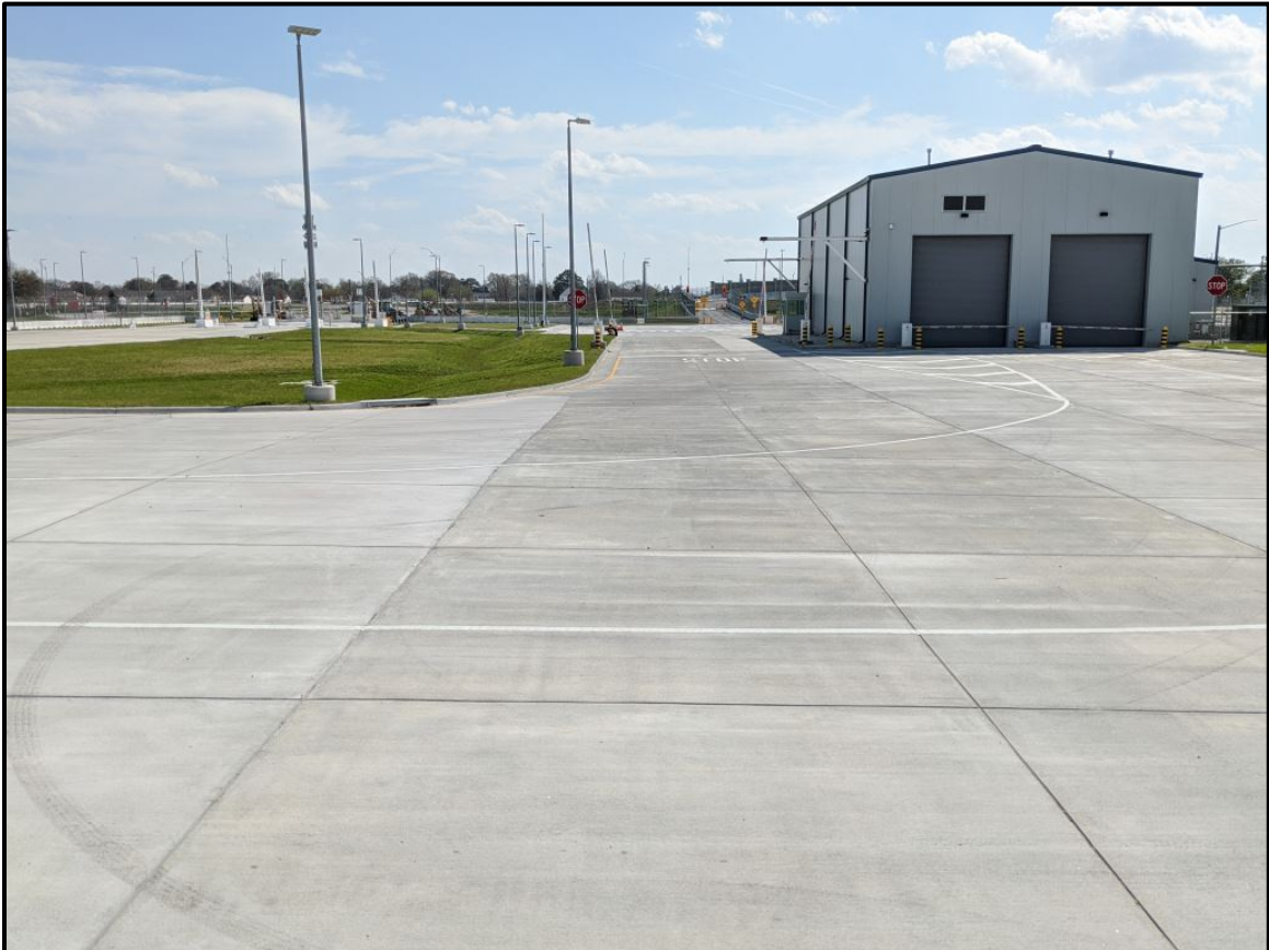
FIGURE 8: CVIS Area (Looking South)