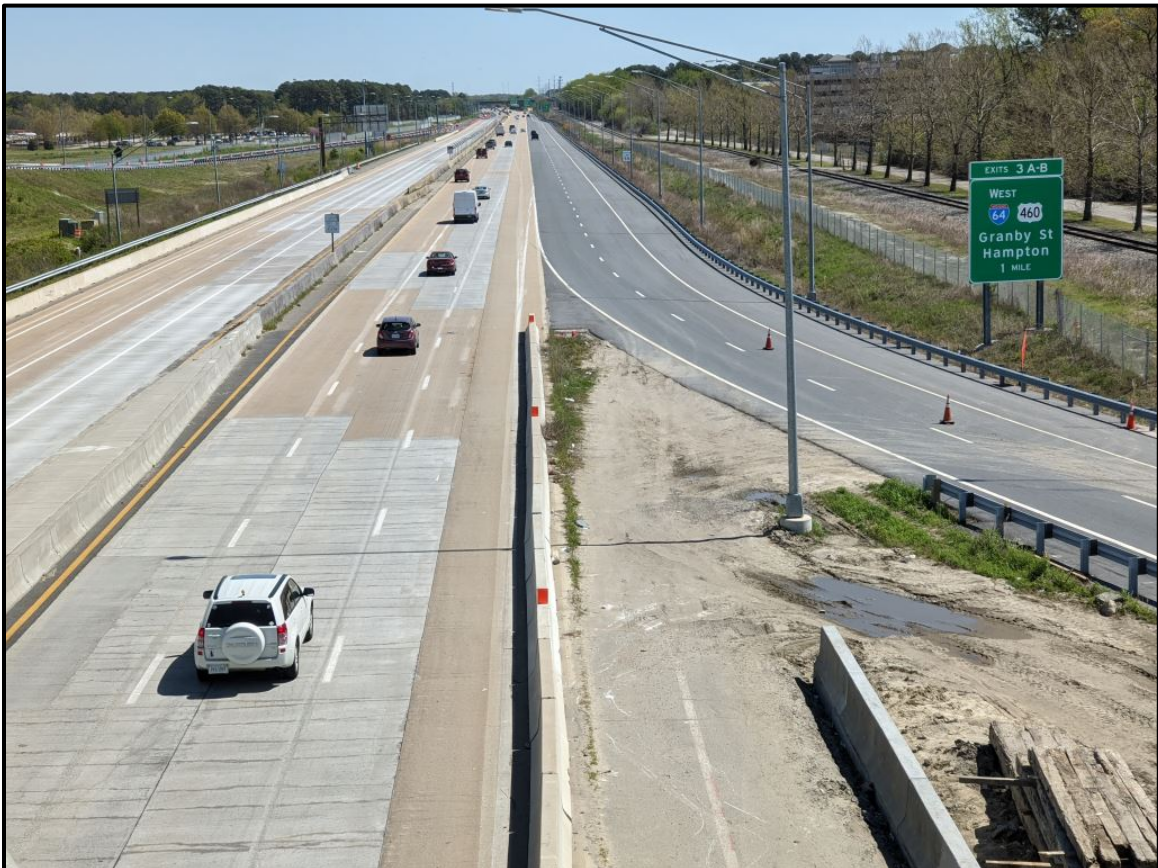
FIGURE 4: I-564 Eastbound and Ramp D from Bridge B602 (Looking East)