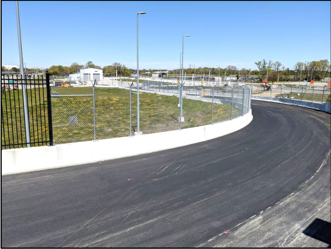
FIGURE 7: CVIS Area (Looking North)