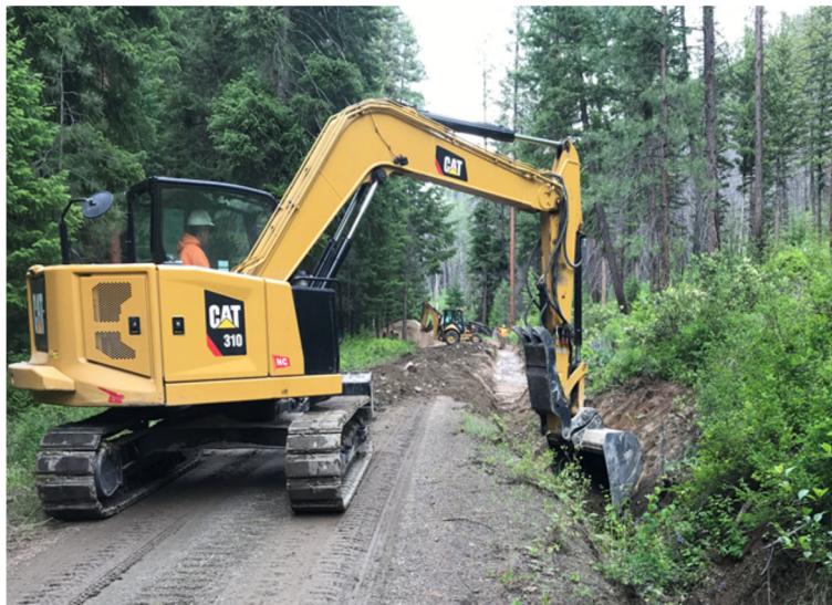
Above: Ditch work on FSR 4415-040

Work on the ditches at Forest Service Road (FSR) 4415-040 MP 0.0 to 0.4 is anticipated to be completed this week. Remaining items of work at FSR 4415-040 MP 0.0 to 0.4 will be completed at the beginning of July.