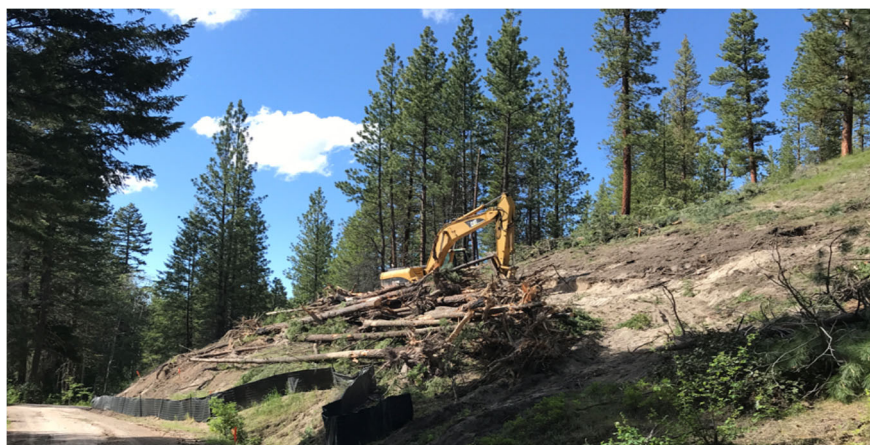
Above: Clearing work at FSR 4150 MP 2.2

The clearing work at FSR 4150 MP 2.2 was completed this week. Excavation work at this location is expect to be completed next week. During this work closures at FSR 4150 MP 2.2 will continue to follow the schedule shown to the right.