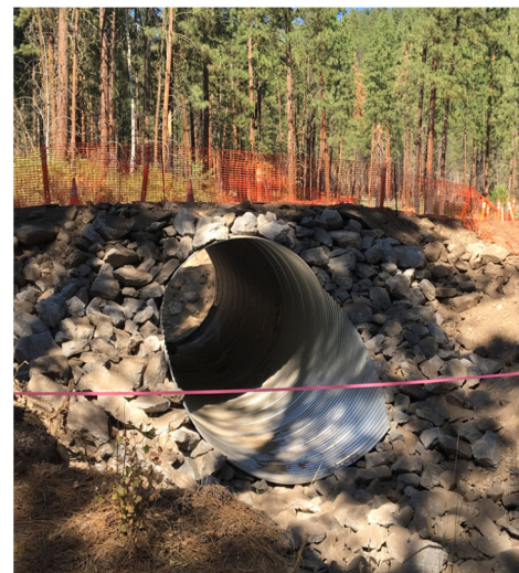
Above: 144-inch pipe culvert inlet and middle section installed at FSR 5008-100 MP 0.75

Please, if the closed signs are up, stay out of the work area. Also, use caution on roads nearby these sites, as there will be increased traffic related to work activities.