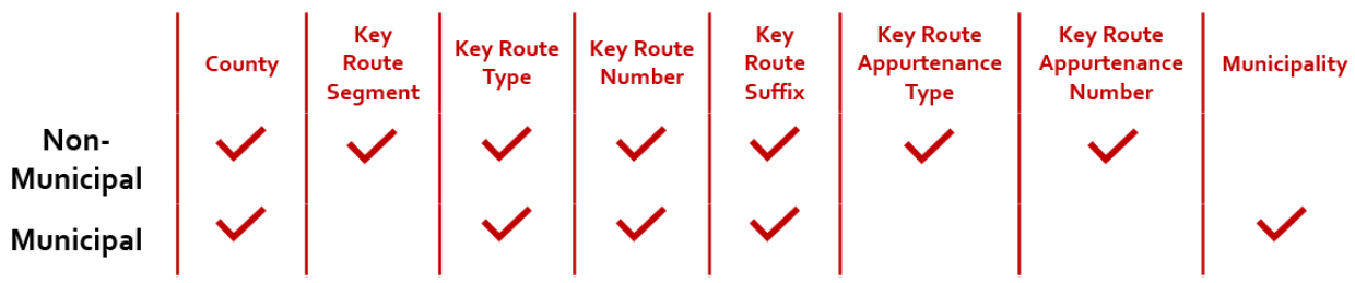
Figure 3. Example of Illinois's Inventory Route ID Naming Convention.