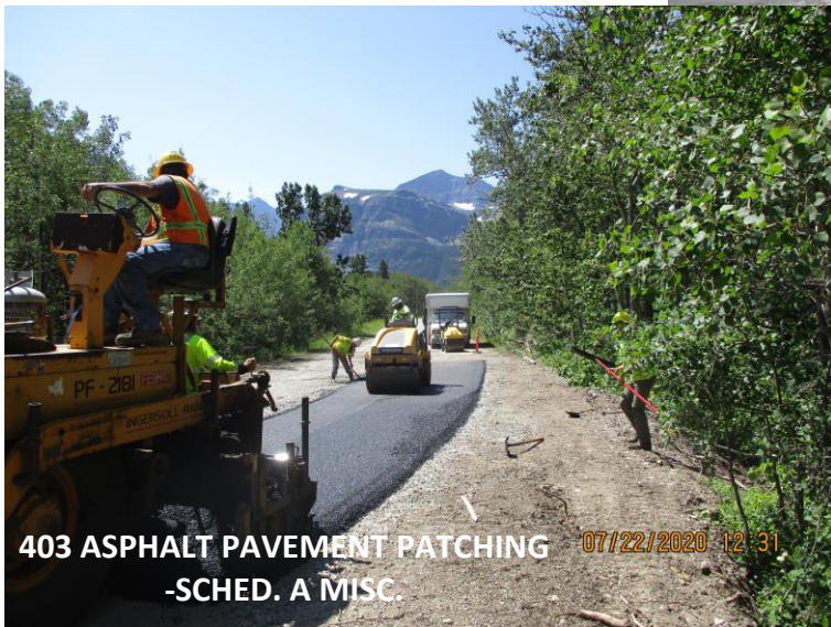
403 ASPHALT PAVEMENT PATCHING 07/22/2020 12:31 -SCHED. A MISC.