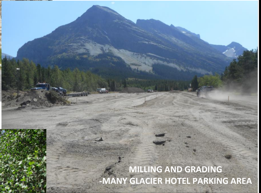
MILLING AND GRADING -MANY GLACIER HOTEL PARKING AREA