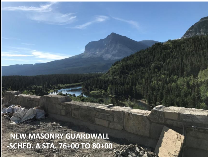
NEW MASONRY GUARDWALL SCHED. A STA. 76+00 TO 80+00