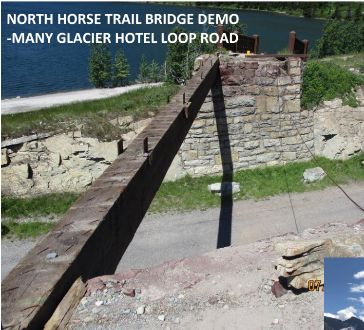
NORTH HORSE TRAIL BRIDGE DEMO -MANY GLACIER HOTEL LOOP ROAD