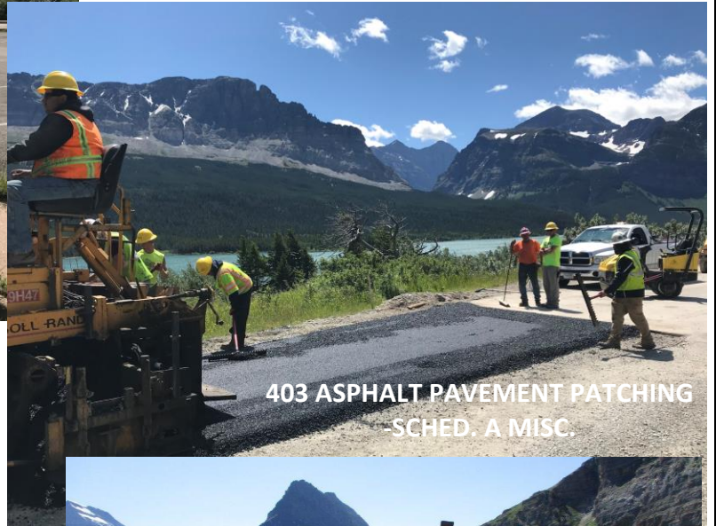
403 ASPHALT PAVEMENT PATCHING -SCHED. A MISC.