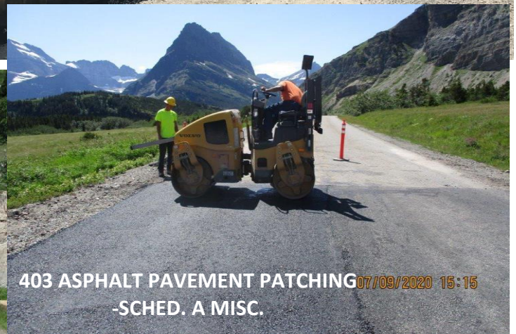
403 ASPHALT PAVEMENT PATCHING 07/09/2020 15:15 -SCHED. A MISC.