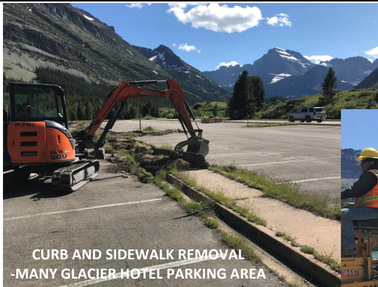
CURB AND SIDEWALK REMOVAL -MANY GLACIER HOTEL PARKING AREA