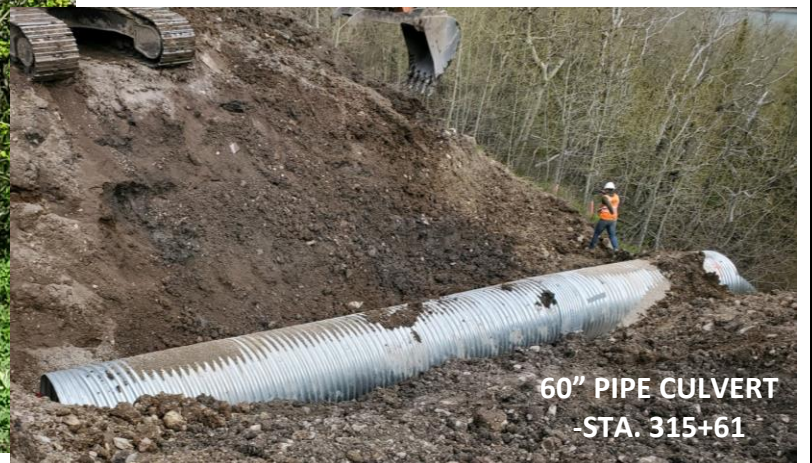
60" PIPE CULVERT -STA. 315+61