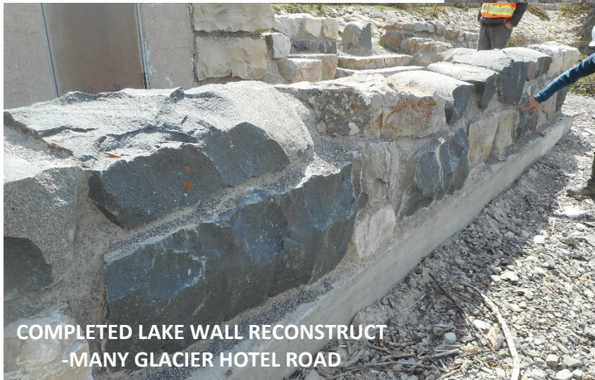
COMPLETED LAKE WALL RECONSTRUCT -MANY GLACIER HOTEL ROAD