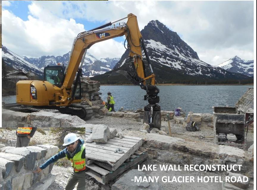
LAKE WALL RECONSTRUCT -MANY GLACIER HOTEL ROAD