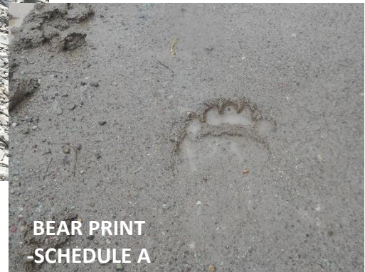
BEAR PRINT -SCHEDULE A