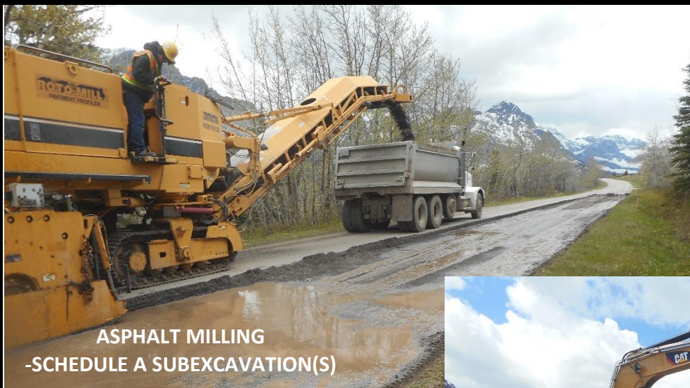
ASPHALT MILLING -SCHEDULE A SUBEXCAVATION(S)