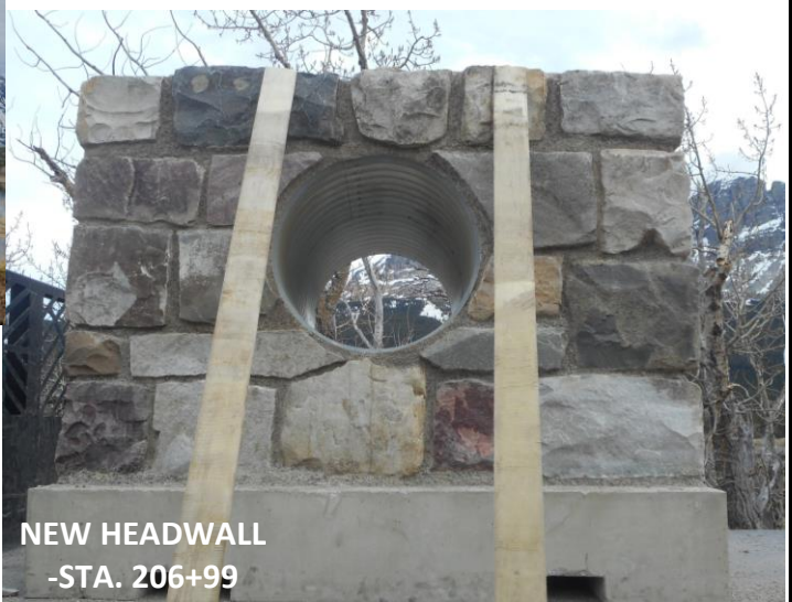
NEW HEADWALL -STA. 206+99