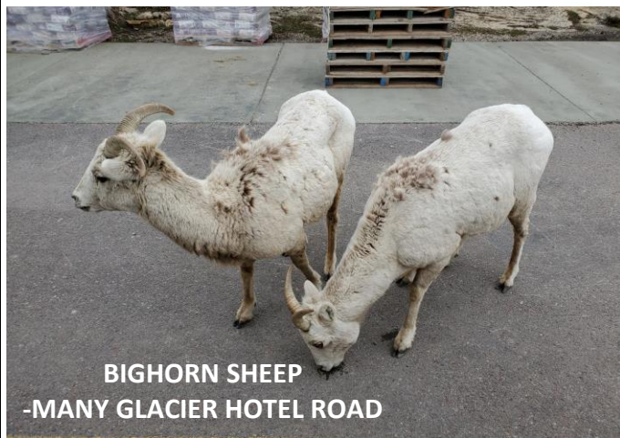
BIGHORN SHEEP -MANY GLACIER HOTEL ROAD