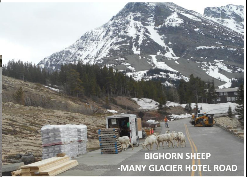
BIGHORN SHEEP -MANY GLACIER HOTEL ROAD