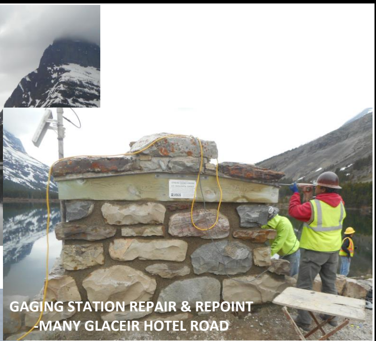
GAGING STATION REPAIR & REPOINT -MANY GLACEIR HOTEL ROAD