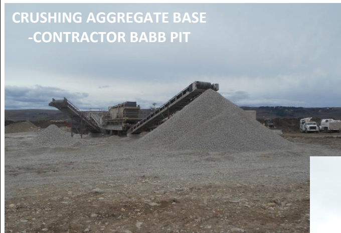
CRUSHING AGGREGATE BASE -CONTRACTOR BABB PIT