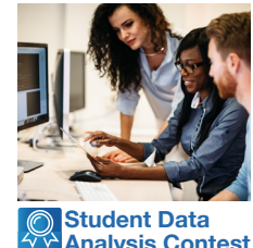
Student contest image: © NDABCreativity/stock.adobe.com. All other images source: FHWA.