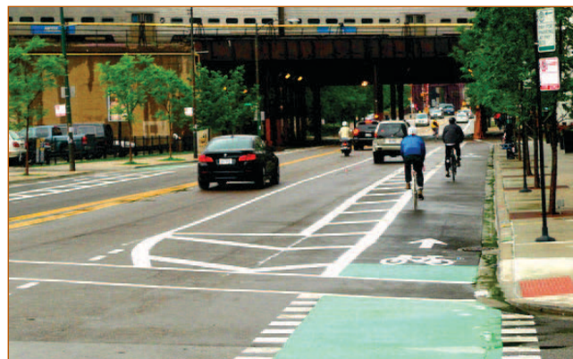
This photo demonstrates several bicycle and pedestrian safety solutions.

Technologies for autonomous and connected vehicles are rapidly improving. Drawing on this technological advancement, the Colorado DOT is leading an active TPF study called Autonomous Maintenance Technology (AMT) to develop autonomous technologies for roadway work zone applications. The 15 State DOTs involved in the TPF study are able to use the combined $1 million of project funding to improve the safety, efficiency, and quality of roadway work. This project will also provide a better understanding of real-world applications of autonomous and connected vehicle technology. Learn more about this project at https://pooledfund.org/Details/Study/632 . (2)