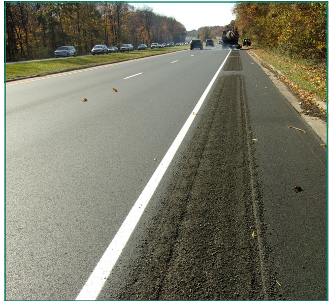
Mumble strips were one of the safety countermeasures developed in the ELCSI study.

The safety countermeasures evaluated in the ELCSI study included a wide variety of topics, such as pedestrian and cyclist solutions, pavement friction, rectangular rapid-flashing beacons, rumble strips, and curve delineation. The researchers evaluated topics and countermeasures for programs and budgets of all sizes.