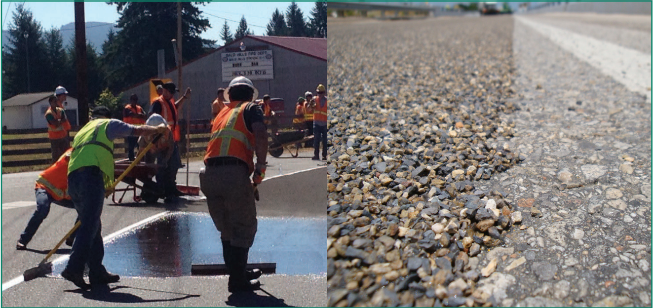
High-friction surface treatment has been shown to significantly reduce wet pavement crashes.

Since its inception, the ELCSI study has adapted to meet the evolution of safety needs throughout the Nation. For example, this TPF study’s “Pavement Safety Performance” project researched different types of flexible and rigid pavement treatments and their applications (like chip seal, concrete diamond grinding, and high-friction surface treatment for horizontal curves). Treating horizontal curves addresses a major safety risk. Approximately one-quarter of highway fatalities occur at or near horizontal curves. The deterioration of pavement’s surface friction could be a factor for roadway departure crashes (a crash which occurs after a vehicle crosses an edge line, a center line, or otherwise leaves the traveled way), particularly in wet weather. The Federal Highway Administration estimates that 70 percent of wet pavement crashes are preventable through improved pavement friction. 3 ELCSI research indicated significant benefits from the use of high-friction surface treatments at curves.