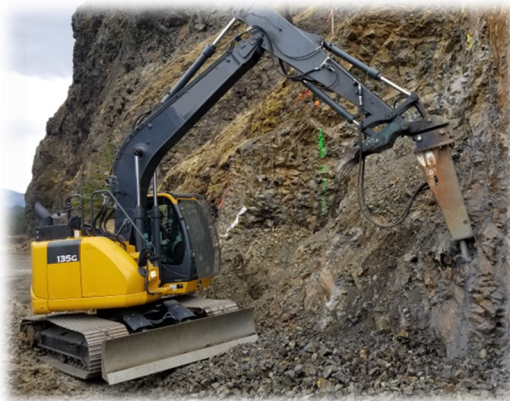
Below Right: West portal rock removal