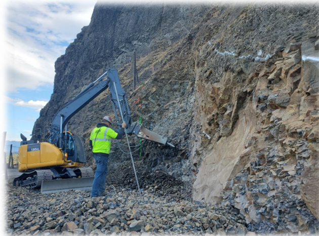
Left: West portal excavation