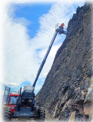
Left & Right: Hanging mesh rockfall protection fence on West Side