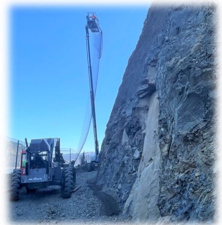
Right: West side hanging fence