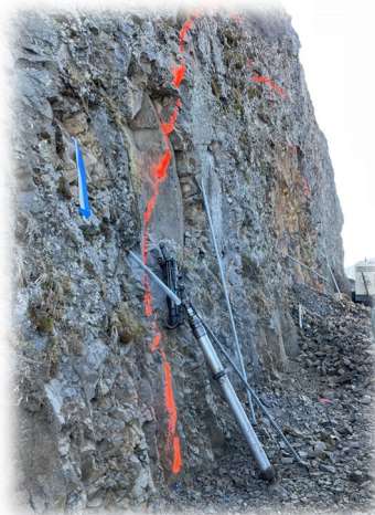
Left: East side portal chipping