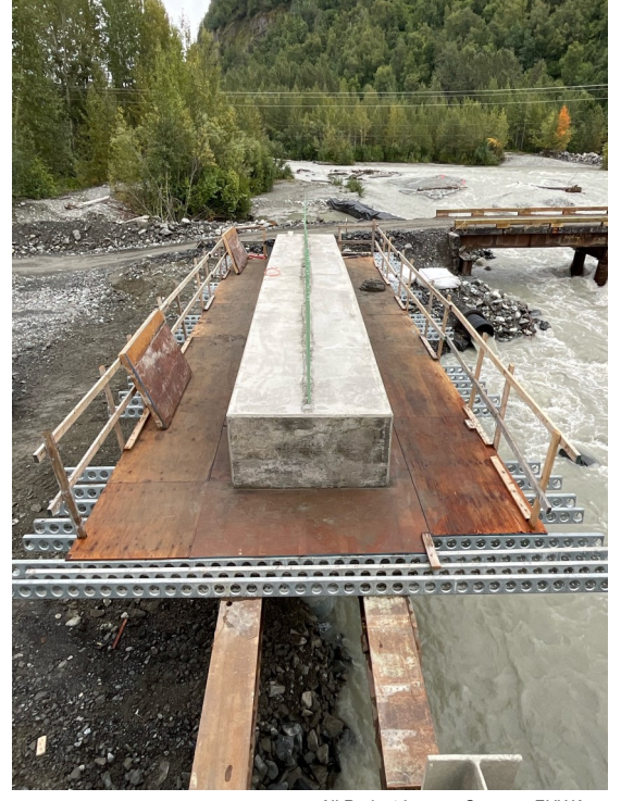
All Project Images Source: FHWA

Right: Recently poured Pier cap 2; forms removed.