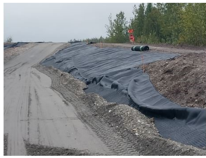
All Project Images Source: FHWA

Left: Subexcavation on Lathrop St. Below: Slope of existing road on Lathrop Street.