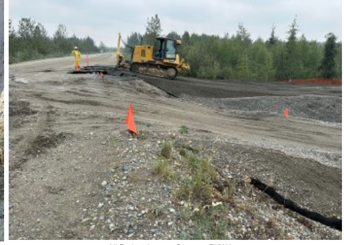
All Project Images Source: FHWA

Below: Placing Select Borrow Type B on Northlake Lane extension at Cinch Street.