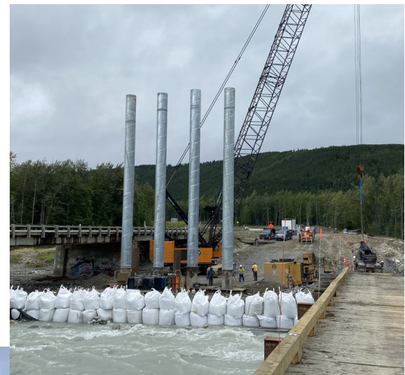
Above and Left: Galvanized piles at Pier 2.