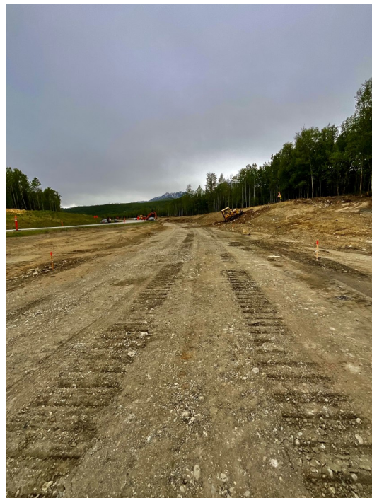
Above: Roadway grading