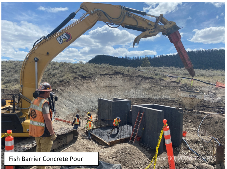
Fish Barrier Concrete Pour