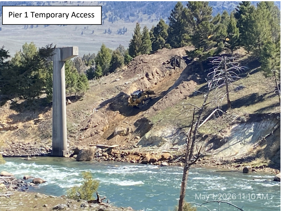
Pier 1 Temporary Access