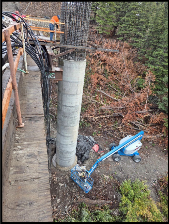
Phase 1 Column Concrete Placement at Pier 3 Completed