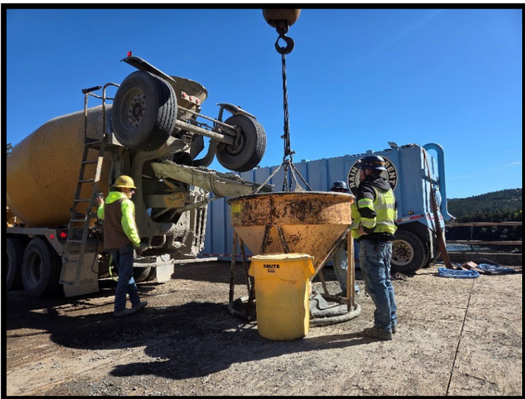
Pier 2 Column Concrete Placement