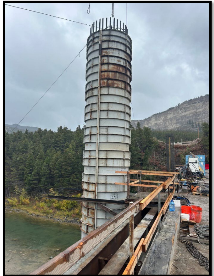
Pier 3 Column Form Placement