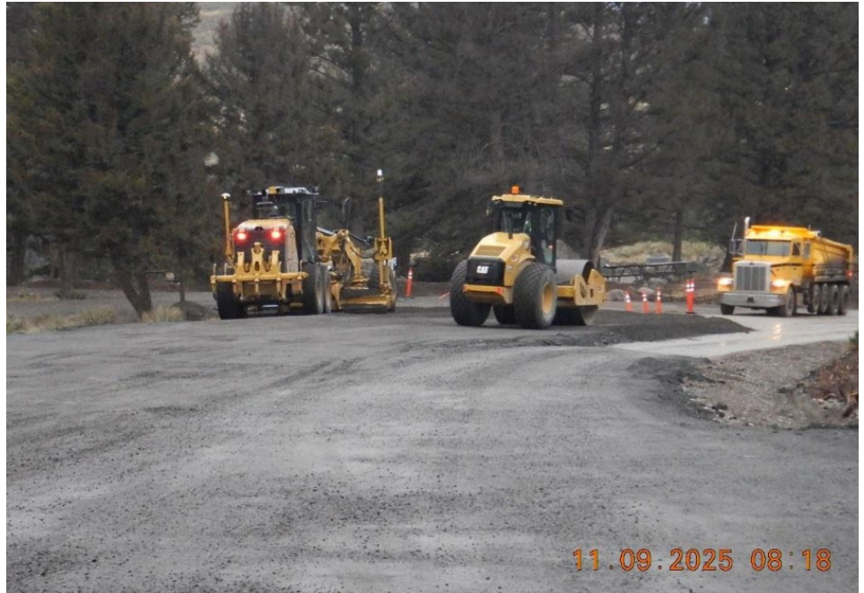
Placing Recycled Asphalt Base