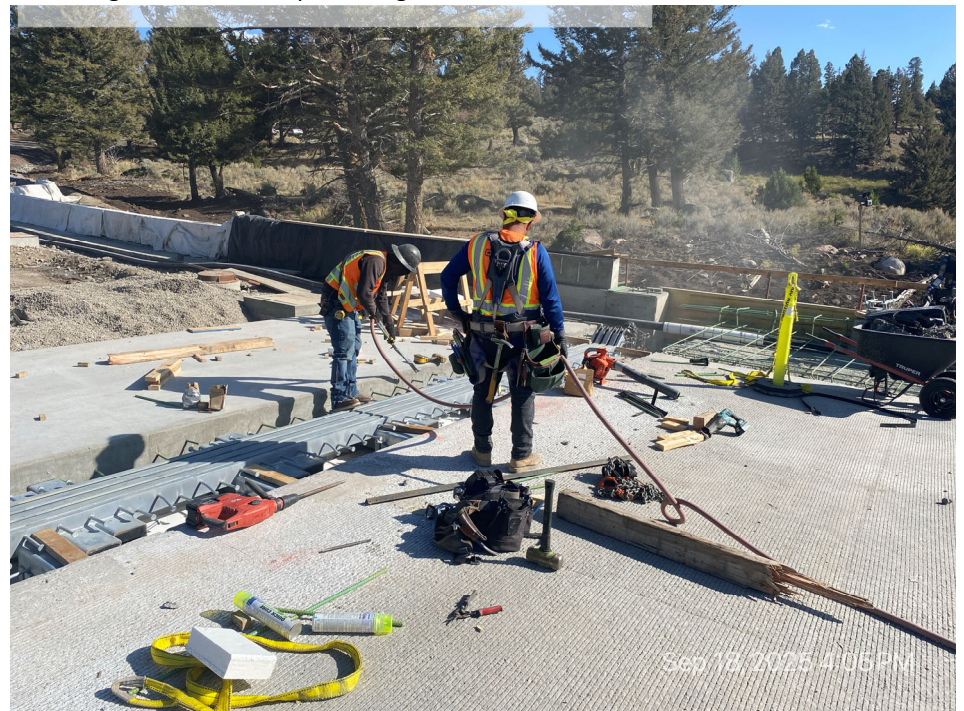
Preparing Abutment 2 Expansion Joint for installation

Project Website: https://highways.dot.gov/federal-lands/projects/wy/nps-yell-12-2