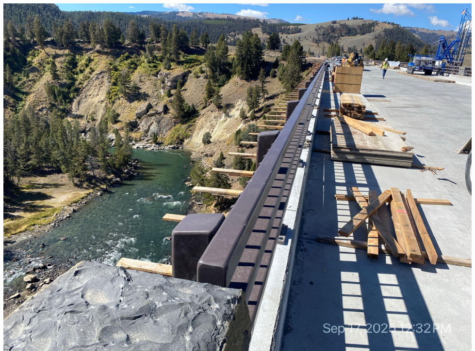
Installation of Bridge Railing

Project Website: https://highways.dot.gov/federal-lands/projects/wy/nps-yell-12-2