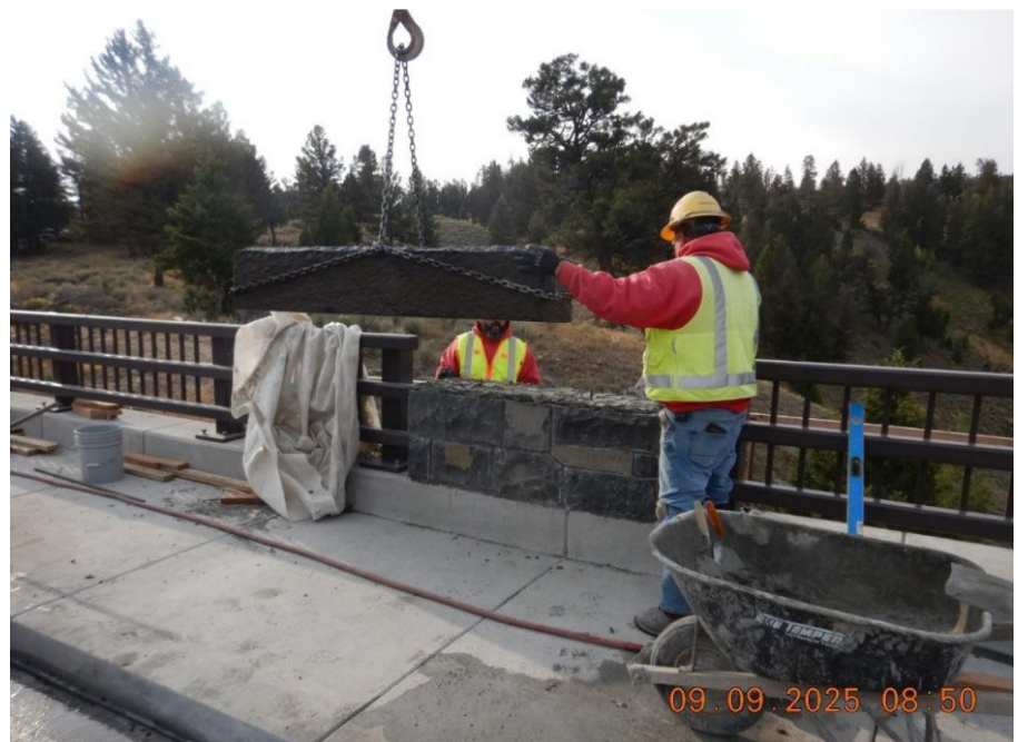
Placing the capstone on a masonry pillar on the Bridge Deck

Project Website: https://highways.dot.gov/federal-lands/projects/wy/nps-yell-12-2