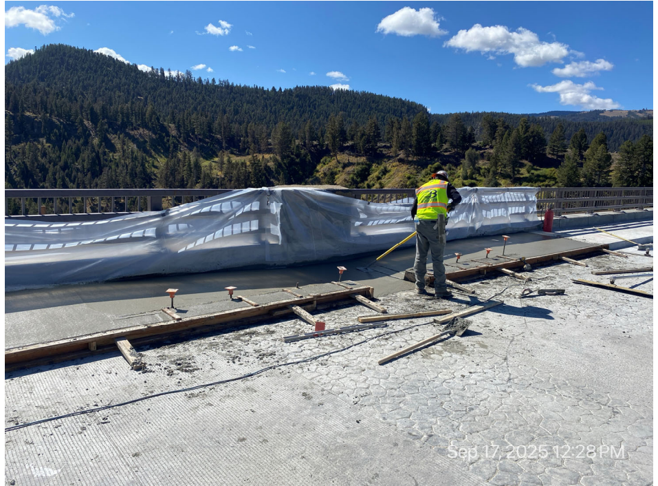
Finishing Pedestrian Ramp on Bridge Deck