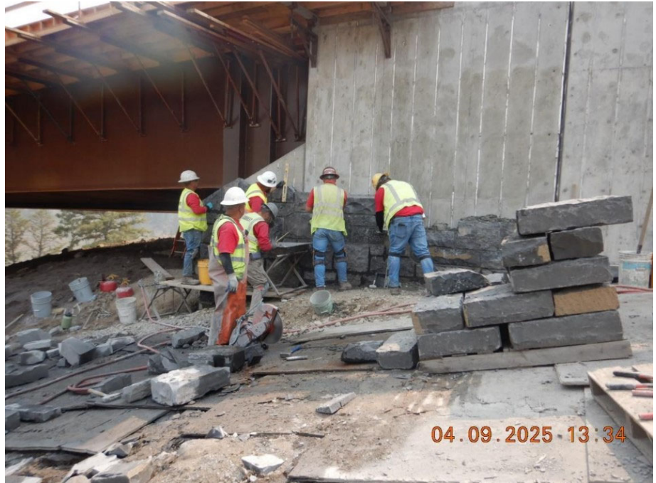
Abutment 2 Masonry