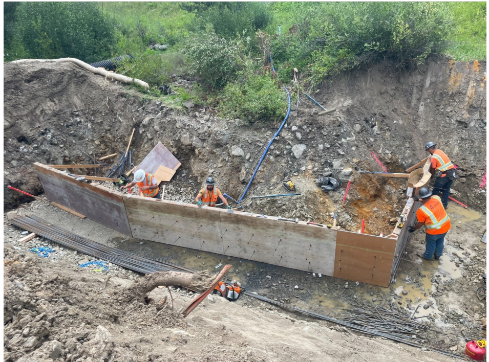
Bull Run #1 Cutoff Wall Forms