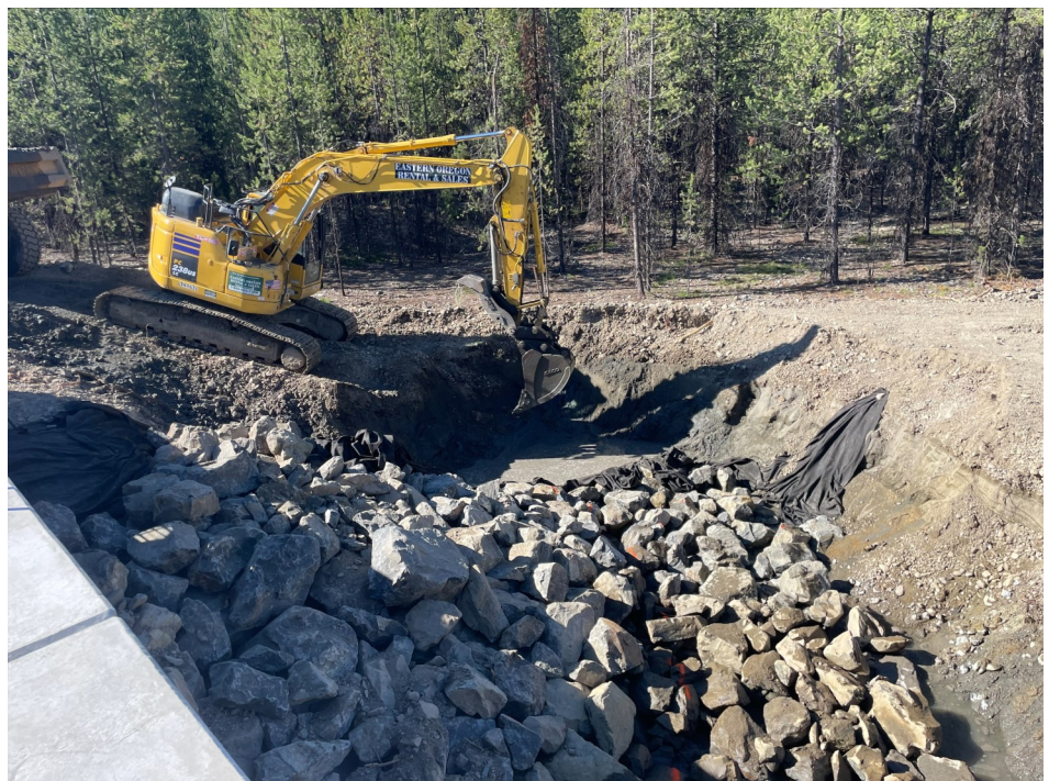
Rip Rap Bull Run #4