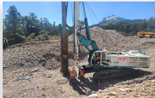
Socketed Pile Drilling 5/8/2025