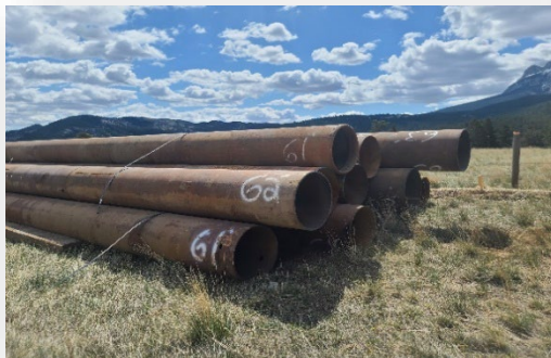
Temporary Bridge Pipe Piles

Deep foundation drilling commenced yesterday. H-pile will be placed in the drilled shafts and then filled with concrete at two abutments, one on each side of the Sun River. These deep foundation shafts are referred to as "Socketed Pile" and are a critical component to the bridge structure.