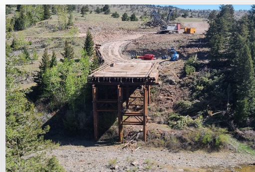
Temporary Bridge Under Construction