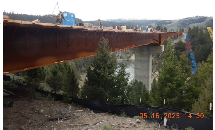
Crews installing the precast deck panels