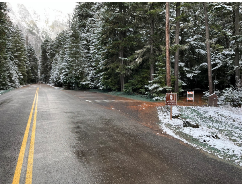
Completed Upper McDonald Creek Trail Parking area