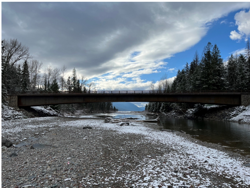
View of the Upper McDonald Creek Bridge looking towards the lake.