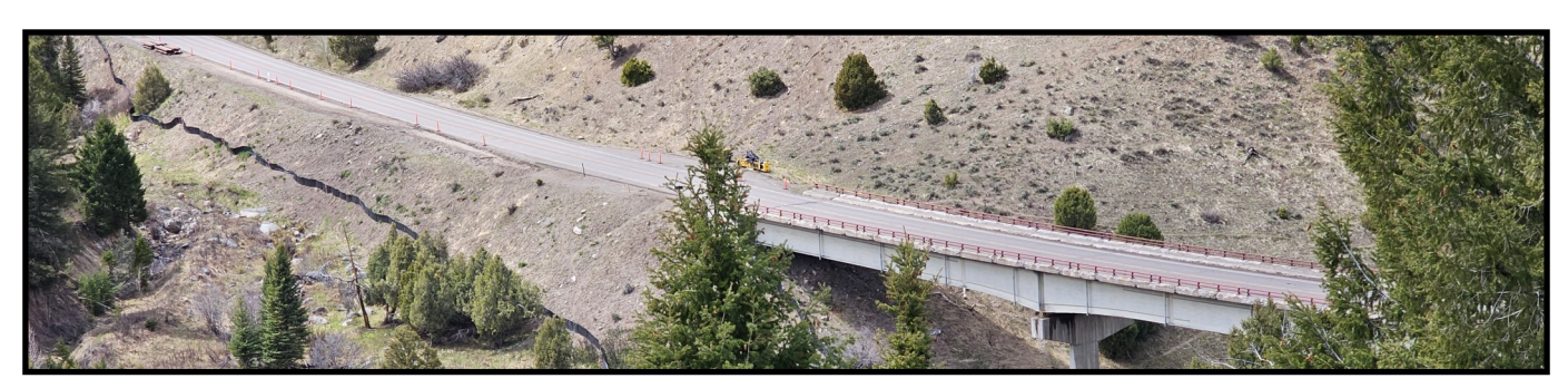
Yellowstone River Bridge October 4th, 2024