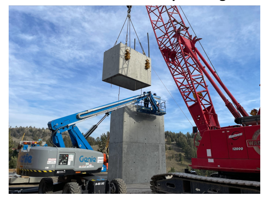
Erection Of Pier 1