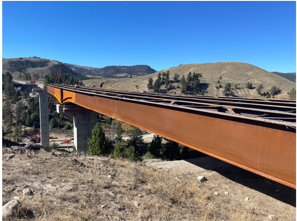
Girders From Pier 3 to ABT 2