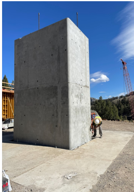
Pier 1 Erection