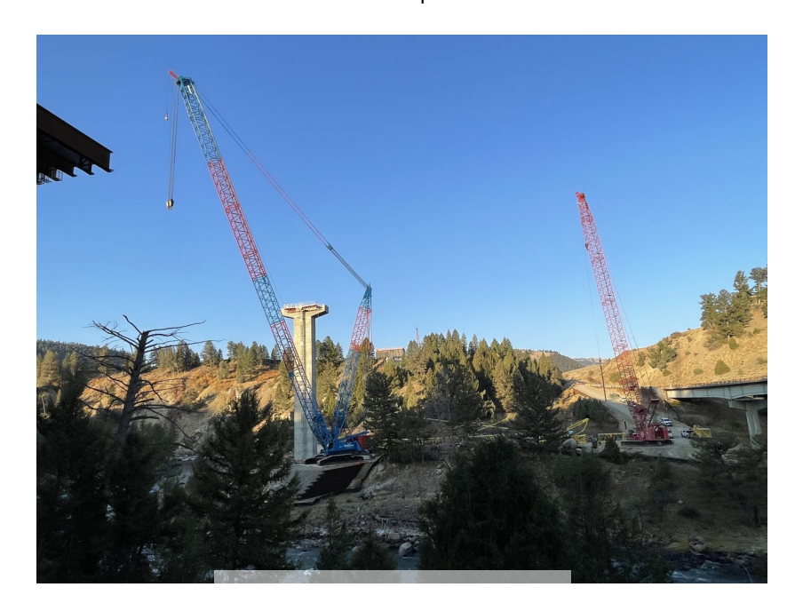
New Crane at Pier 2