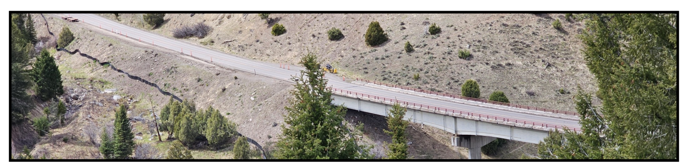
Yellowstone River Bridge